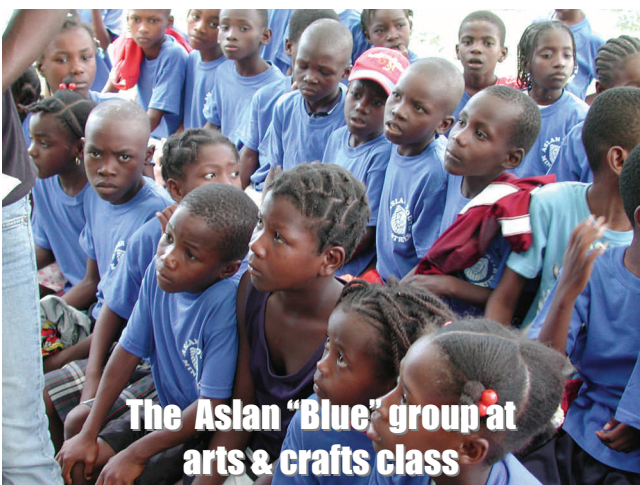
The Aslan "Blue" group at arts & crafts class

Taking select Aslan teens to Haiti (one of the poorest nations on earth) is counterintuitive to lots of folks; but we have found it has more impact on our kids in less time than anything we've ever done! Talk about stretching and pushing these young people out of their comfort zones!